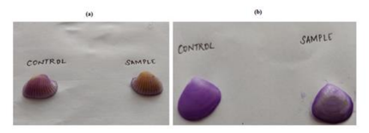
Figure 2: Inhibition of Streptococcal biofilm by ethanolic extract of P. betle, with ridged shells (a) and smooth shells (b).

appeared mildly purple (Fig. 2). This indicates that PE has ability to inhibit streptococcal biofilm formation. Similar results were obtained in the presence of methanolic extracts of galls of Quercus infectoria <sup>[30]</sup>.